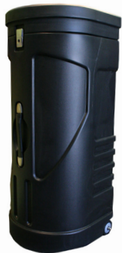
Half Hard Case is optional.