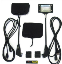
*Optional 200 watt halogen lights