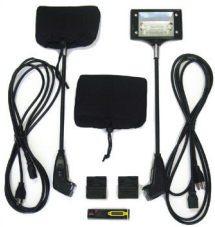
*Optional 200 watt halogen lights