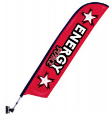
30° Falcon Flag Mount