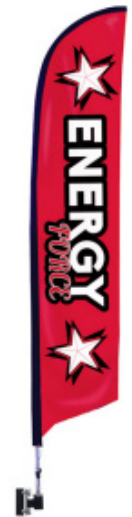
0° Falcon Flag Mount